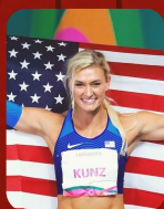
Annie Kunz 2020 Olympian